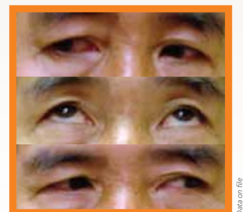
3 views of patient moving eyes without restriction